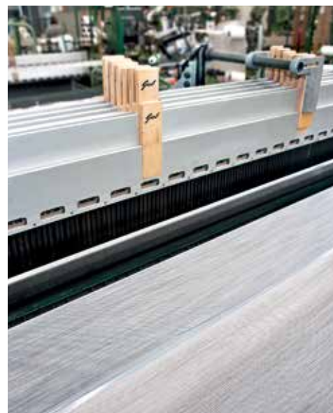
Ambiance made in Switzerland: ZETACOUSTIC fabric production

From development and design to preparing the yarn, weaving and finishing, Création Baumann acoustic fabrics are created in their own design studio and production facility in Langenthal, Switzerland. The wide range of products allows great flexibility when responding to market trends and customer requirements – with typical Création Baumann quality. Over 125 years of expertise is woven into each fabric, which is finished to top technical and environmental standards.