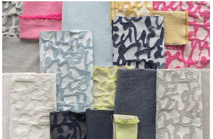
FOREVERYOUNGDENIM + DIARY 1.JPG