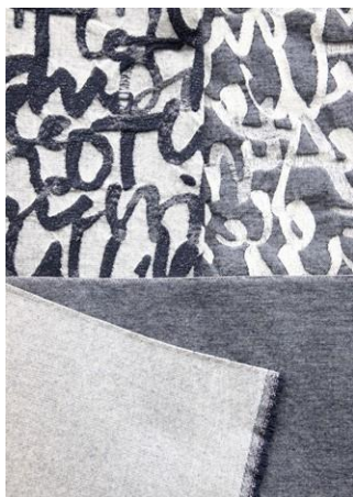
FOREVERYOUNGDENIM + DIARY 2.JPG