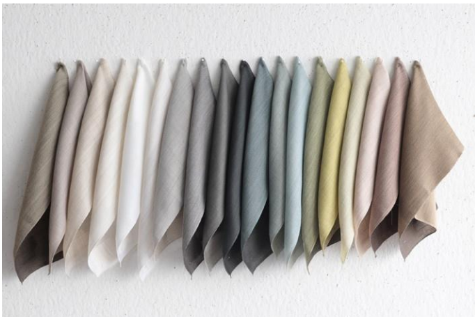
FOREVERYOUNGSHARI ECO 1.JPG