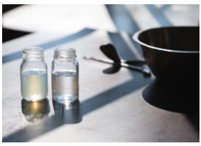
As a certified sustainable company, we take care regarding our resources'

Improving the ecological balance is an ongoing concern for Création Baumann. Our products are therefore distinguished by their intelligent design, the highest quality standards and innovative production processes. We already take the environmental impact over the entire life of the products into account when selecting raw materials during the product development stage.