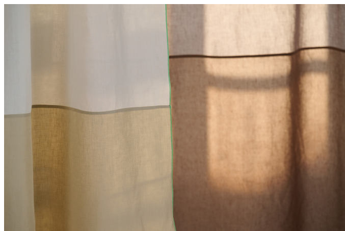
lavie-Telos-Color-Block-shell-beige-mood-Photo Ruedi Flueck.jpg

When using the image material, please state: Photo Ruedi Flück