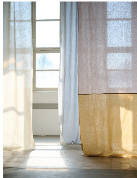
lavie-Telos-Color-Block-rose-pear-mood-Photo Ruedi Flueck.jpg