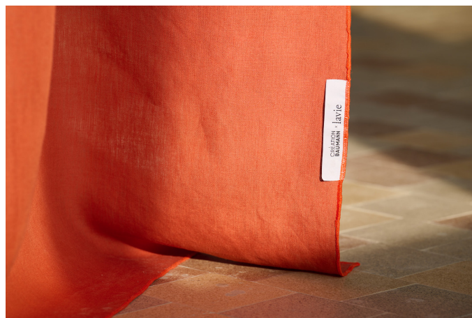
lavie-Telos-Color-Block-hblau-rost-label-Photo Ruedi Flueck.jpg