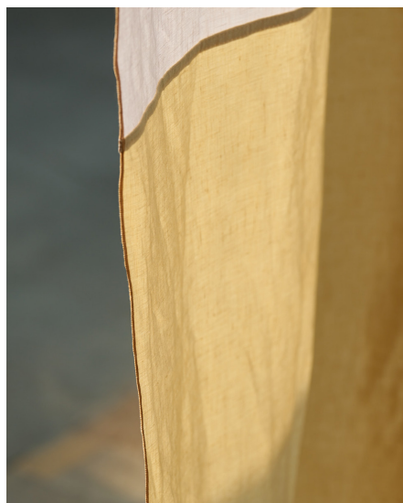
lavie-Telos-Color-Block-rose-pear-closeup-Photo Ruedi Flueck.jpg

When using the image material, please state: Photo Ruedi Flück