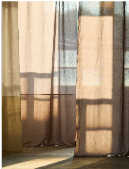
lavie-Telos-grape-mood-Photo Ruedi Flueck.jpg