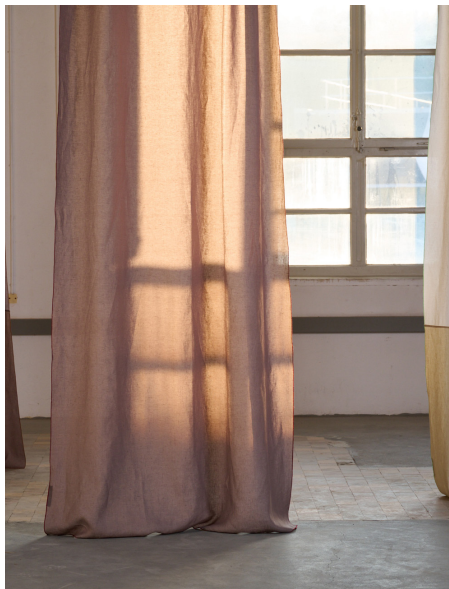
lavie-Telos-grape-Photo Ruedi Flueck.jpg

To receive high-resolution images, please contact Brand. Kiosk via: creation-baumann@brand-kiosk.com