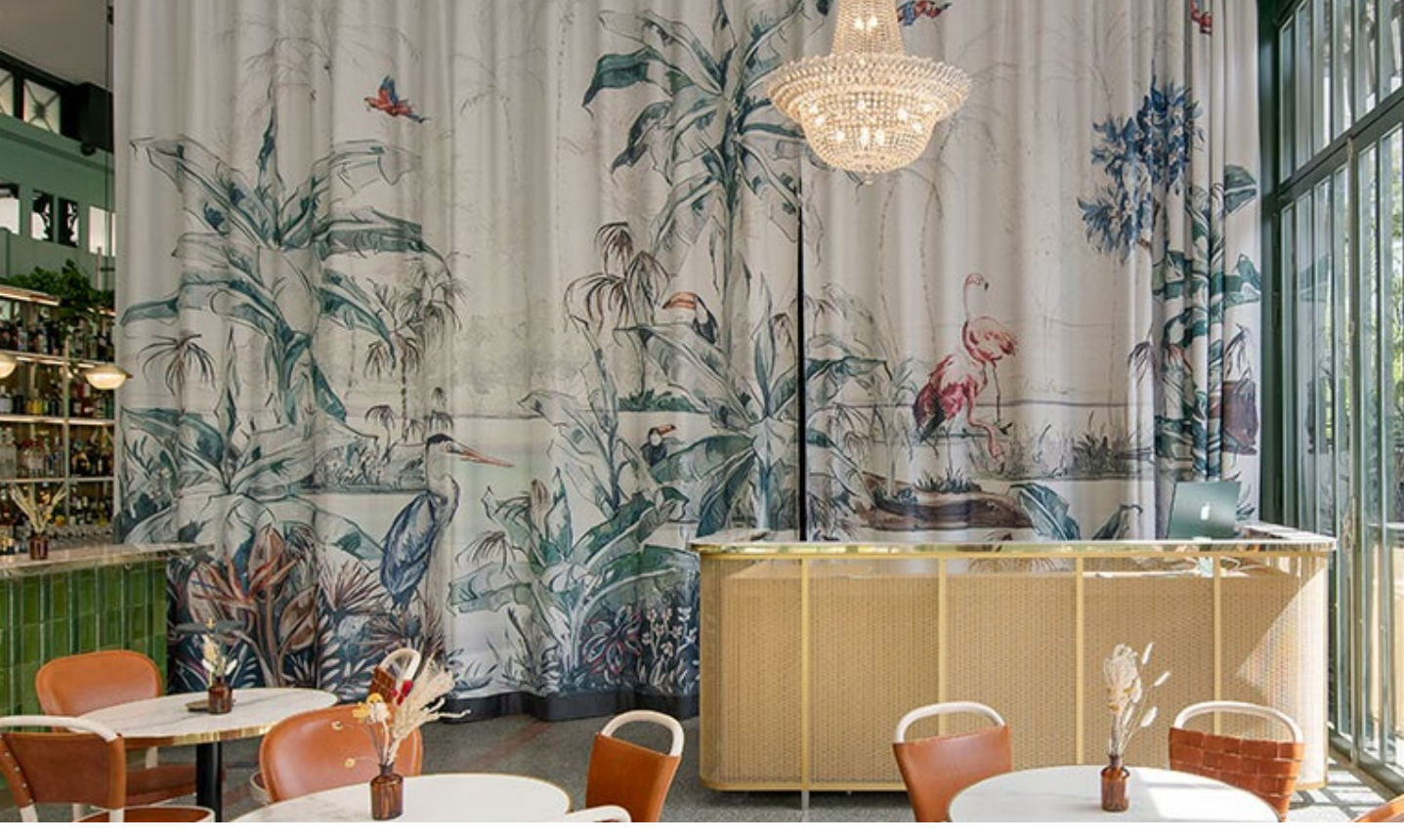
Object: Kiosque des Bastions, Geneva, Switzerland