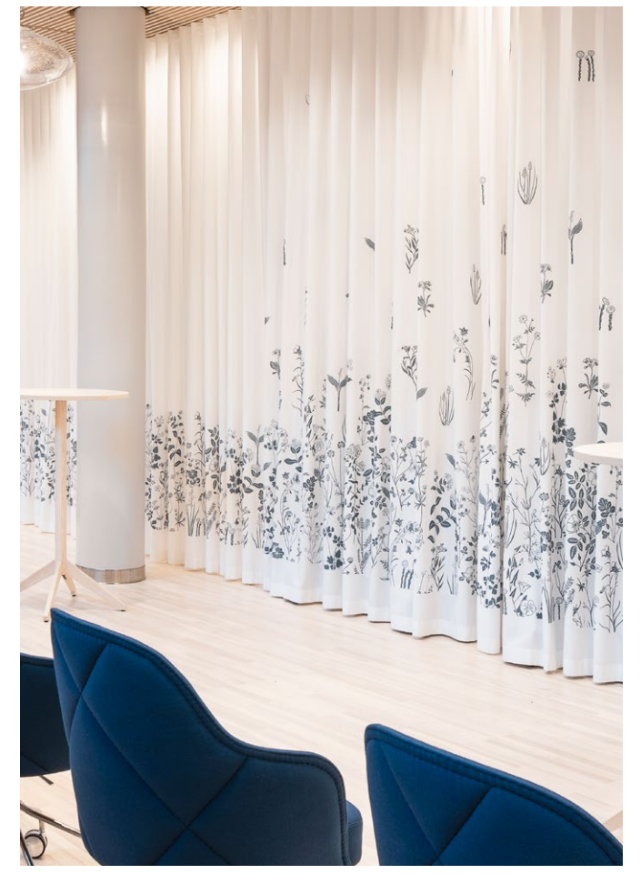
Object: Uppsala Stadshus, Uppsala, Sweden