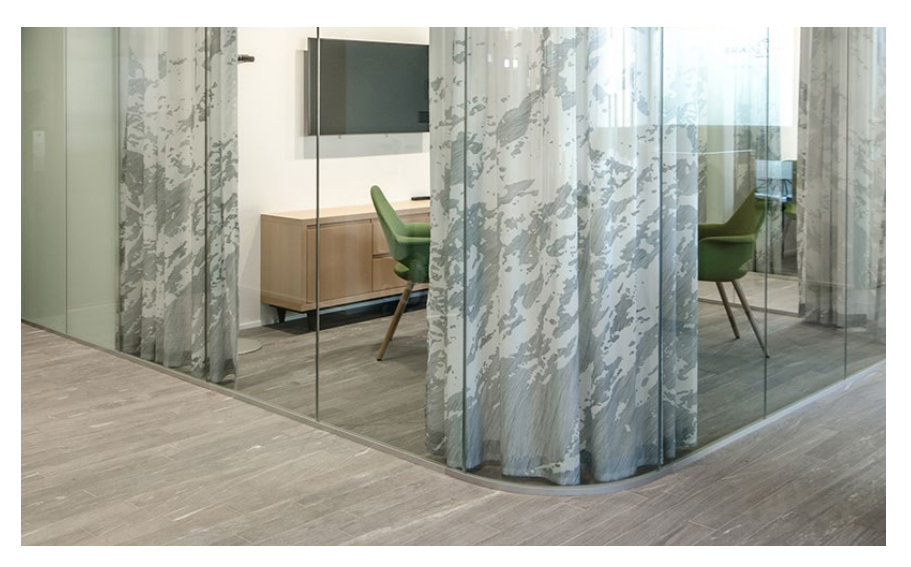
Object: Bank EKI, Interlaken, Switzerland

Whether you are looking for curtains, roller blinds, partitions, acoustic panels or any other kind of interior textiles, our range not only offers you unlimited scope in terms of fabric design, it also gives you complete freedom to incorporate textiles into your interior design in any way you like. We recommend taking a look at our website for ideas and examples. Visit creationbaumann.com/references to find various references from each area of application.