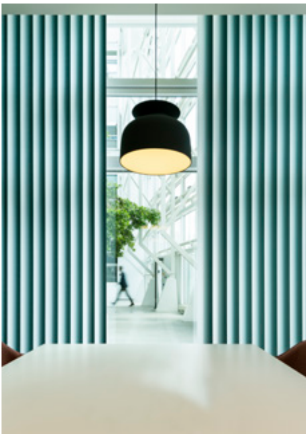
RAYS, transfer print on IROLO

A unique quality feature of our vertical blinds is that most of them are selvedge-woven, with firm selvedges that do not fray even after years of use. Most textile blinds are made of Trevira CS and therefore offer properties such as flame retardancy and dimensional stability.