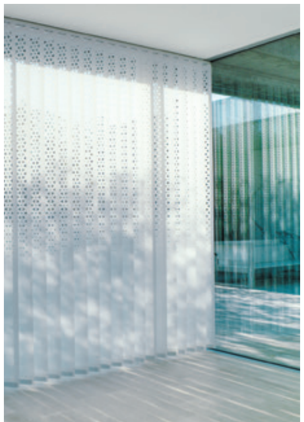
LASER LACE V on IROLO