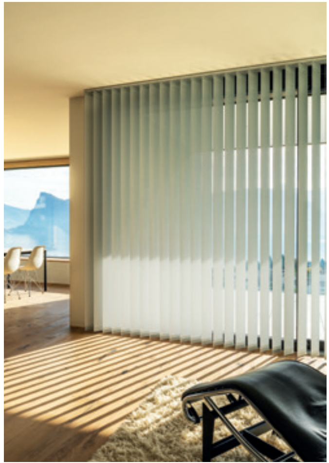
Private house, Hergiswil, Switzerland